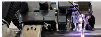
Piping and welding