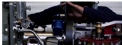
Mechanical systems and operating tools