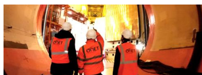
Logistics for large construction sites